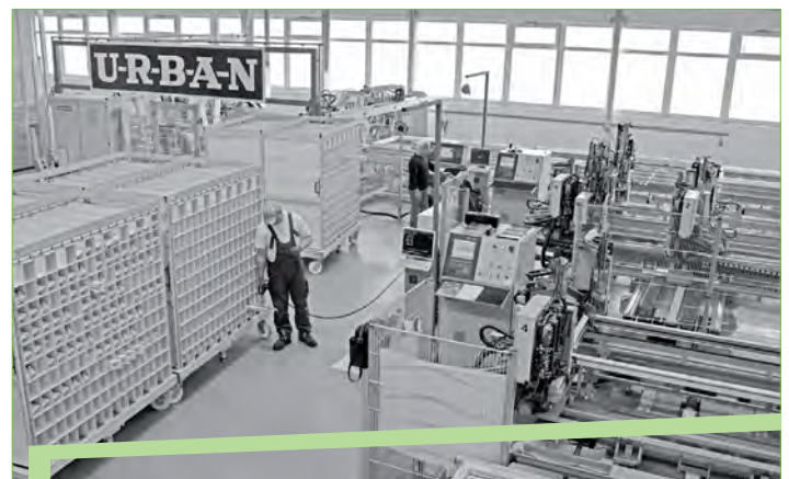
Welding and cleaning line by Urban at Arndt Fenstertechnik