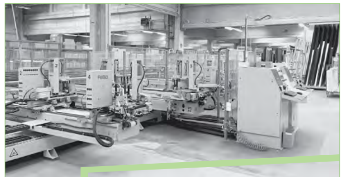
Production at Feba in Burbach