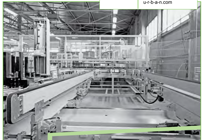
View into the production of Balet + Roux in Martigny

Contact: 08331/858-233 faruk.polat@u-r-b-a-n.com