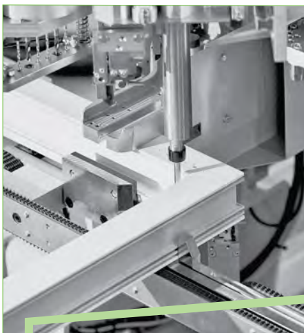
The SV 530-C by Urban

The new generation SV 530-C: High efficiency control technology and convenient operation