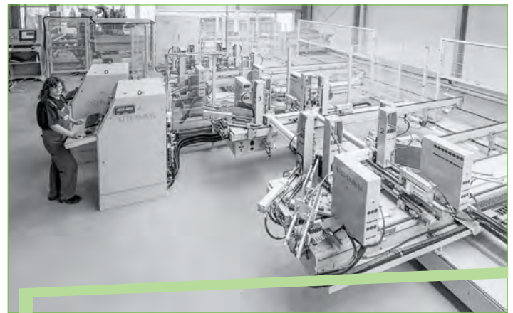
Urban-Sash-Frame-Line at Fresand in Steffenshagen.