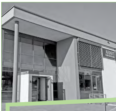
New customer center by Arndt Fenstertechnik