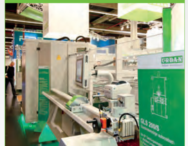
Glazing bead saw GLS 200/S