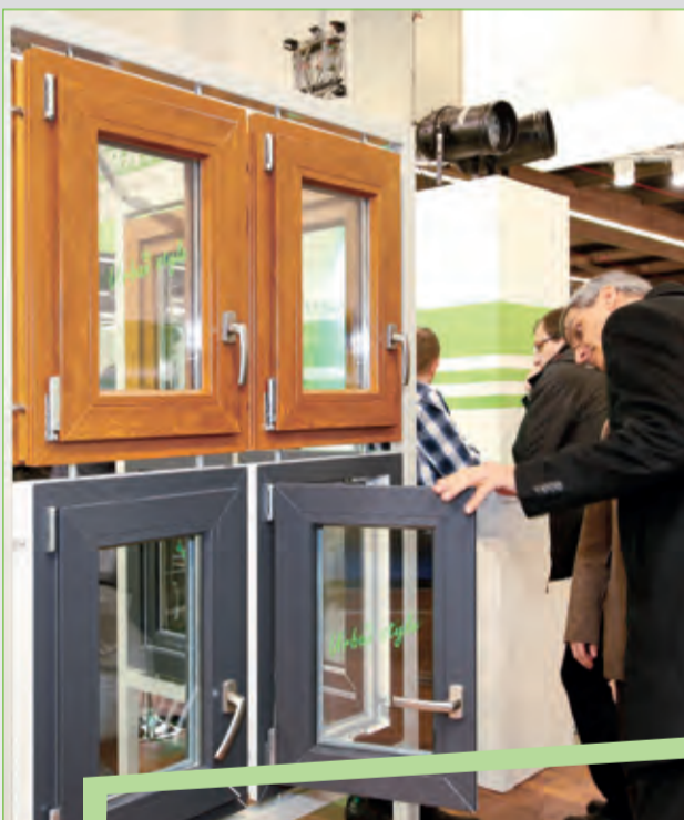
Great corners - the main focus

„Great corners“ made in „Urban style“; this was -among others- the main focus on Urban's trade fair booth.