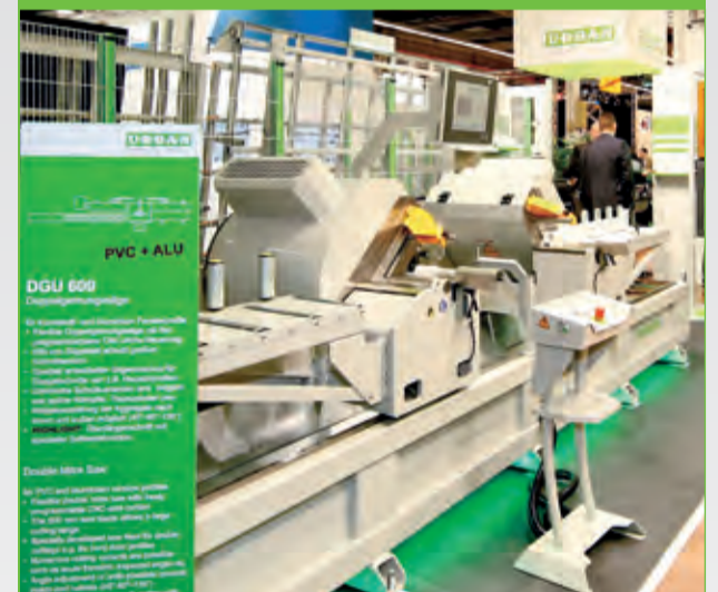
Double mitre saw DGU 600