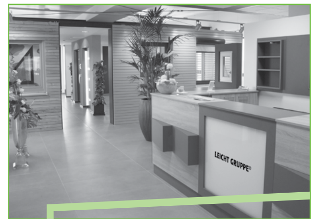
New exhibit in Karlsdorf

Why window producers rely on know-how made by Urban