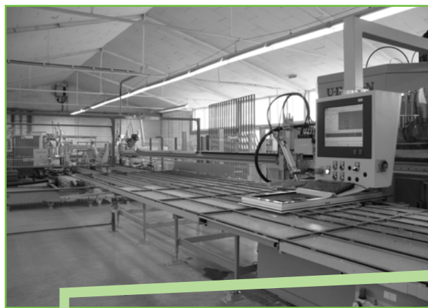
CNC-Corner cleaning machine SV 530

Contact: 08331/858-243 helmut-happe@u-r-b-a-n.com